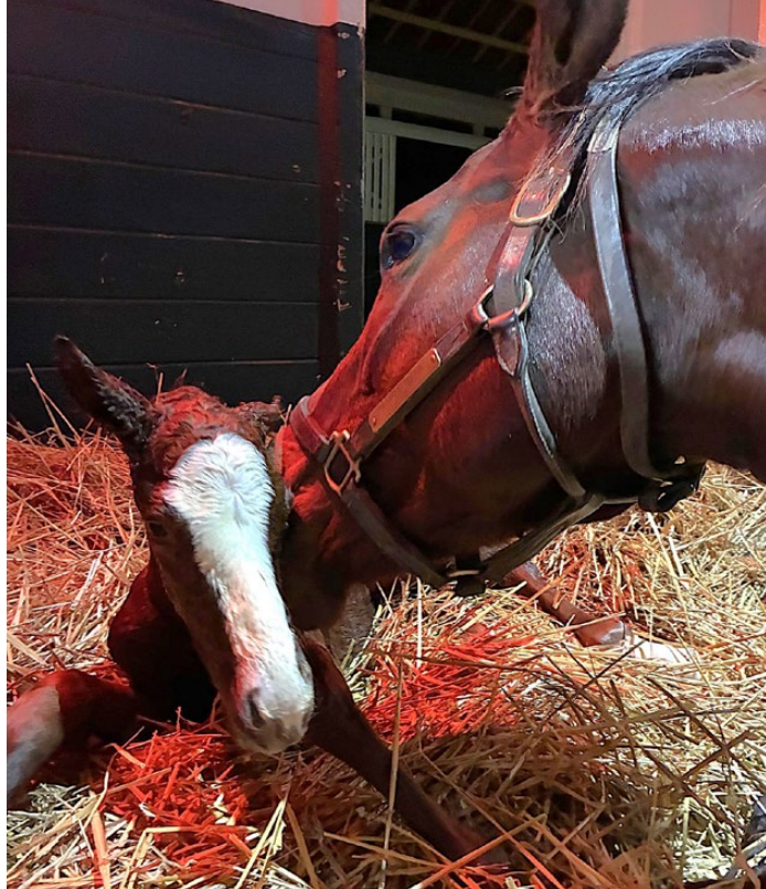
A Charge It filly out of Overt born Jan. 5 at Darby Dan Farm