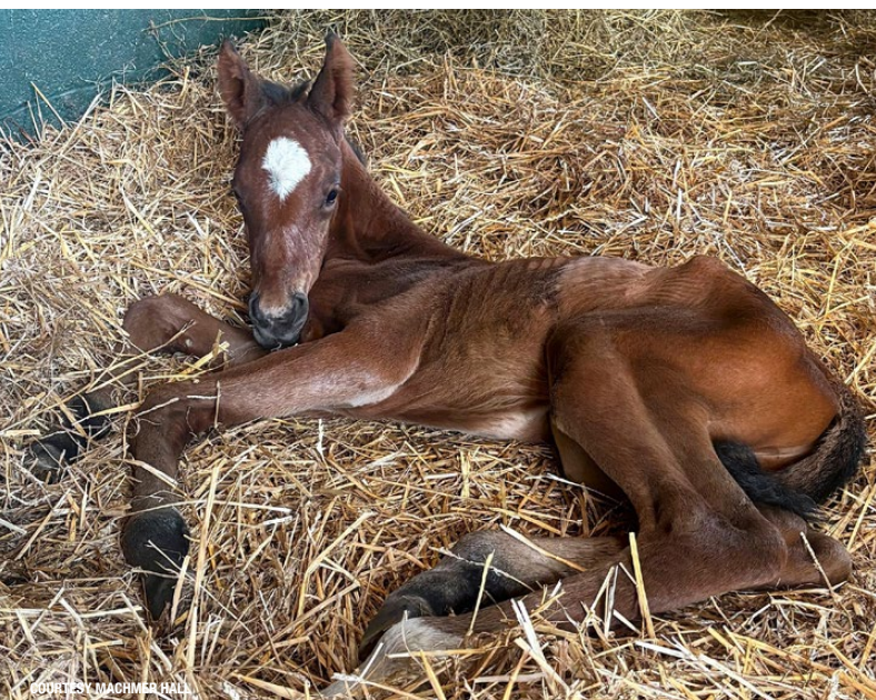
A colt by Charge It out of Six Sense born Jan. 5 at Machmer Hall

At Darby Dan Farm, the Ghostzapper mare Overt had a filly for breeder Healthy Wood Co. This is the third foal out of the daughter of grade 3 winner Antipathy (A.P. Indy), who is a half sister to multiple grade 1 winner and prominent international sire Scat Daddy, along with stakes winners Grand Daddy and Lovestruck. Overt's second dam is grade 1 winner Likeable Style.