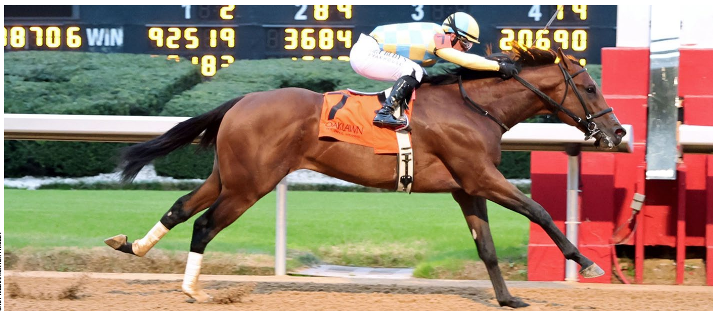
Strategic Risk wins the Smarty Jones Stakes at Oaklawn Park