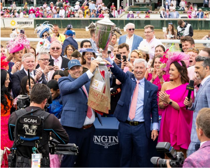
Godolphin pulled off the Kentucky Oaks/Kentucky Derby double